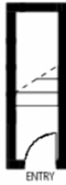
FOURTH FLOOR ENTRANCE